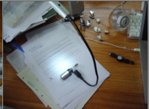
Fig 9. USB light on Caddy as desk light.