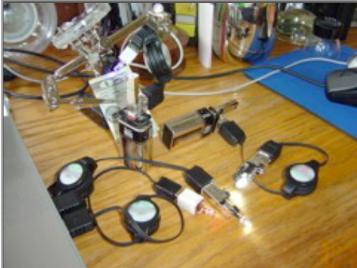
Fig 1. Jacklamps on cables on ports/Jacklamp Caddies.

Home About Products Buy FAQ FYI Pics NUN