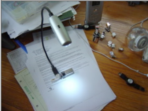
Fig 10. USB light on Caddy as desk light.