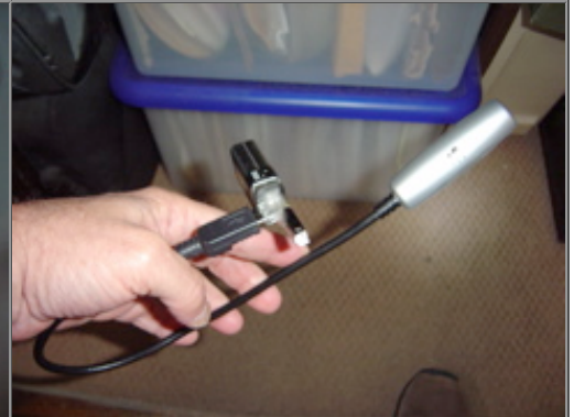
Fig 6. USB light on Caddy as handheld light.