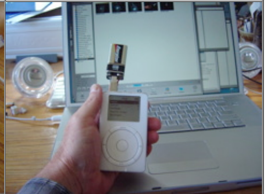
Fig 12. Caddy on my G1 iPod charging.