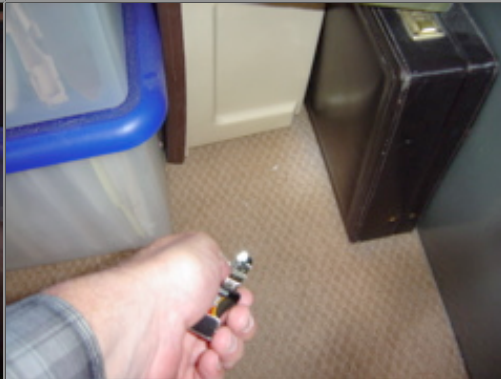
Fig 5. Jacklamp on Caddy is a handheld light.