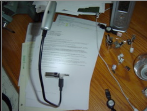
Fig 8. USB light on Caddy as desk light.