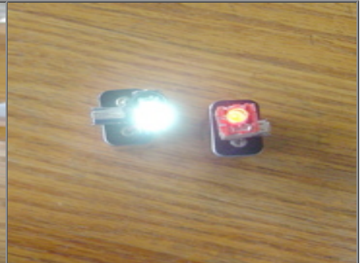
Fig 3. Jacklamps on Jacklamp Caddies.