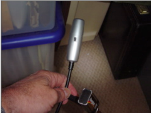
Fig 7. USB light on Caddy as handheld light.