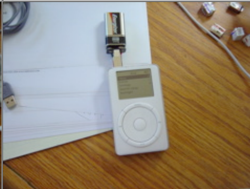
Fig 11. Caddy on my G1 iPod charging.