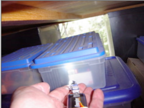
Fig 4. Jacklamp on Caddy is a handheld light.